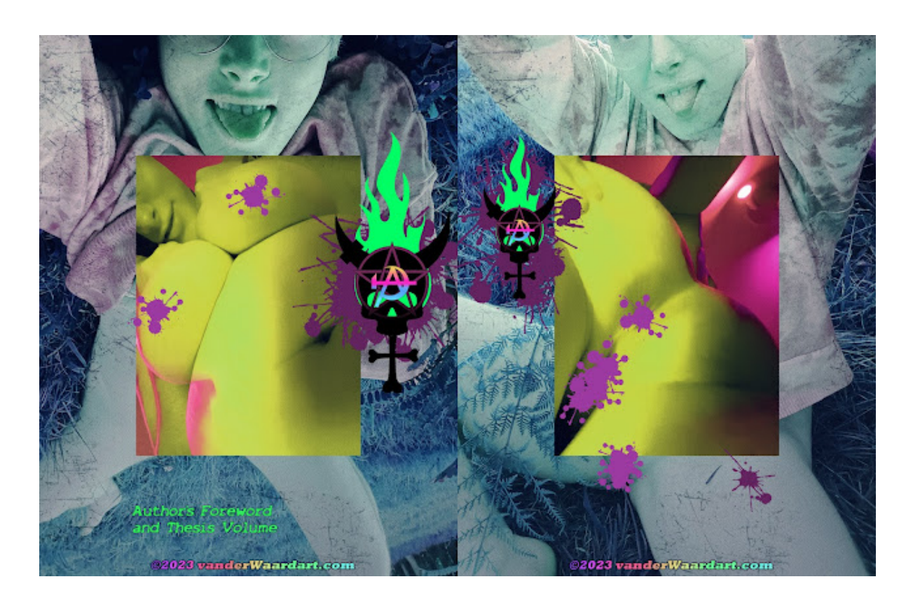
Lastly, I updated my book sample on here so it only has the manifesto on it; the thesis statement was outdated and will be uploaded in its final form when it debuts my website.

9/6/2023: I updated my thesis again, writing a ~11,000 word "camp map" that talks about camping canon to subvert heteronormativity's harmful effects (including Capitalism Realism) and a thesis conclusion that wraps everything up. All in all, I wrote about ~20,000 words in six days (from 8/31 to 9/6) expanding on my initial thesis statement (not including the symposium, which is another ~17,000 words, though I'm not sure how much of it was new or old material before/after 8/31). The base argumentation didn't change; it was more like building a pearl around sand—to include as many key points and arguments that I could. I also wrote a " cheat sheet," whose heads-up (comprehension pointers) and assemblage of maxims, equations and cherry-picked block quotes from the thesis/"camp map" covers some of my book's most productive and widely-used ideas. Lastly, I decided today that sending links that break whenever I update uploaded new versions of the uploaded file is a bad idea: Click here to access my website's 1-page promo, which contains all relevant download links/information regarding my book.